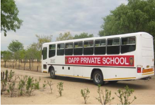
The new school bus