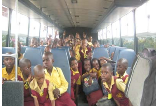
Children going to school