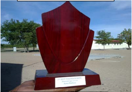
Award for Mathematics